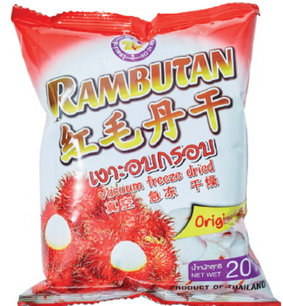
Rambutan 20 gm

SHELF LIFE : 18 MONTHS PACKING : 36 BAGS / CTN (20 GM x 36 BAGS) LOADING : 1,000 CTN / 20 FT