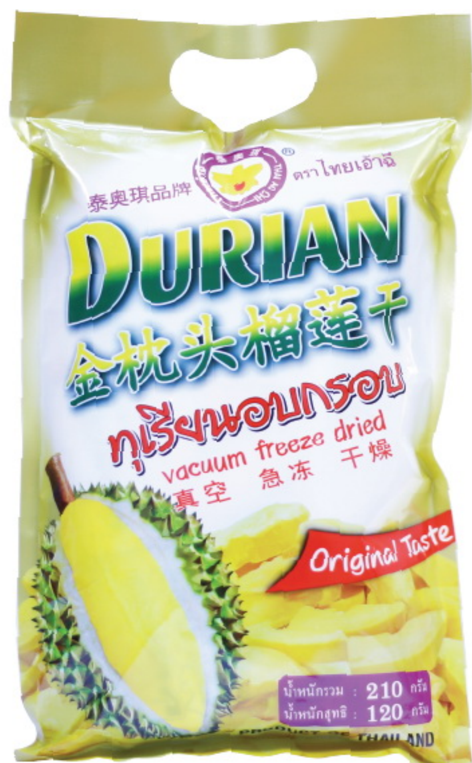
Durian 120 gm

KING OF FRUIT : Freeze Dried Durian is a snack made from a perfect combination between the popular fruit, "durian", and special ingredients offering sweet flavor and crunchy texture through "freeze drying" technology that can well preserve the taste and nutritive value.