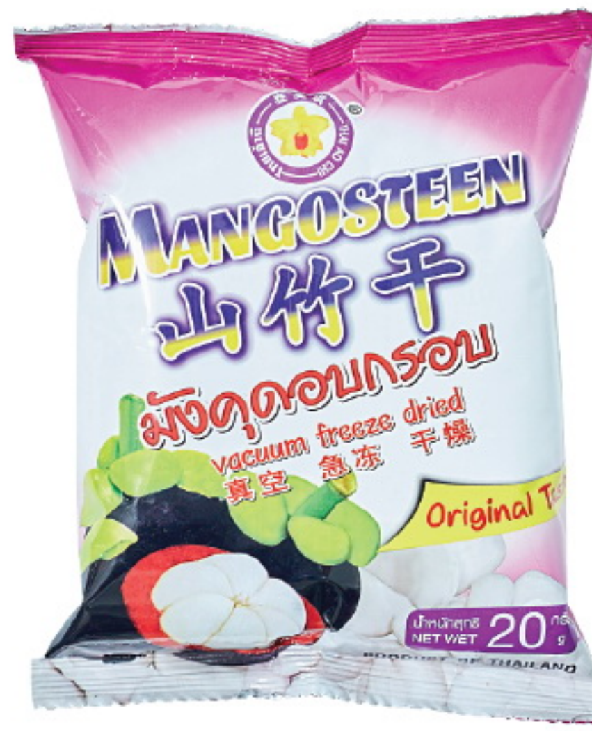
Mangosteen 20 gm

SHELF LIFE : 18 MONTHS PACKING : 36 BAGS / CTN (20 GM x 36 BAGS) LOADING : 1,000 CTN / 20 FT