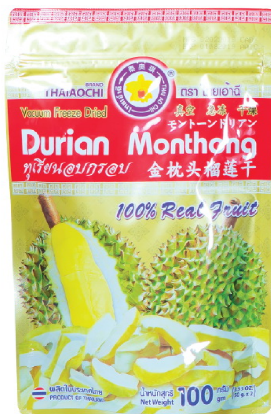
Durian 100 gm

SHELF LIFE : 18 MONTHS PACKING : 1.2 KG / CTN (120 GM x 10 BAGS) LOADING : 960 CTN / 20 FT