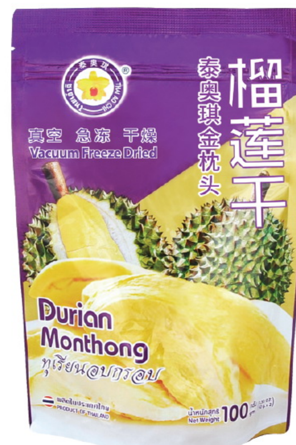
Durian 100 gm

SHELF LIFE : 18 MONTHS PACKING : 2.0 KG / CTN (100 GM x 20 BAGS) LOADING : 1,000 CTN / 20 FT