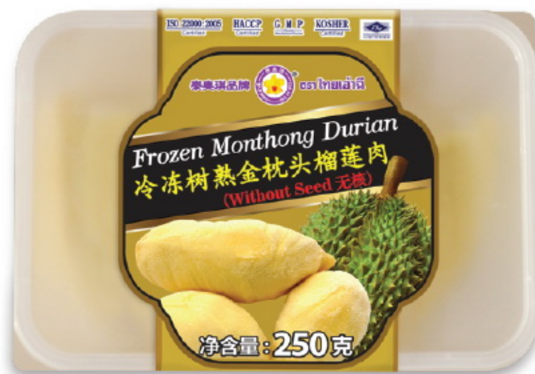
Durian 250 g