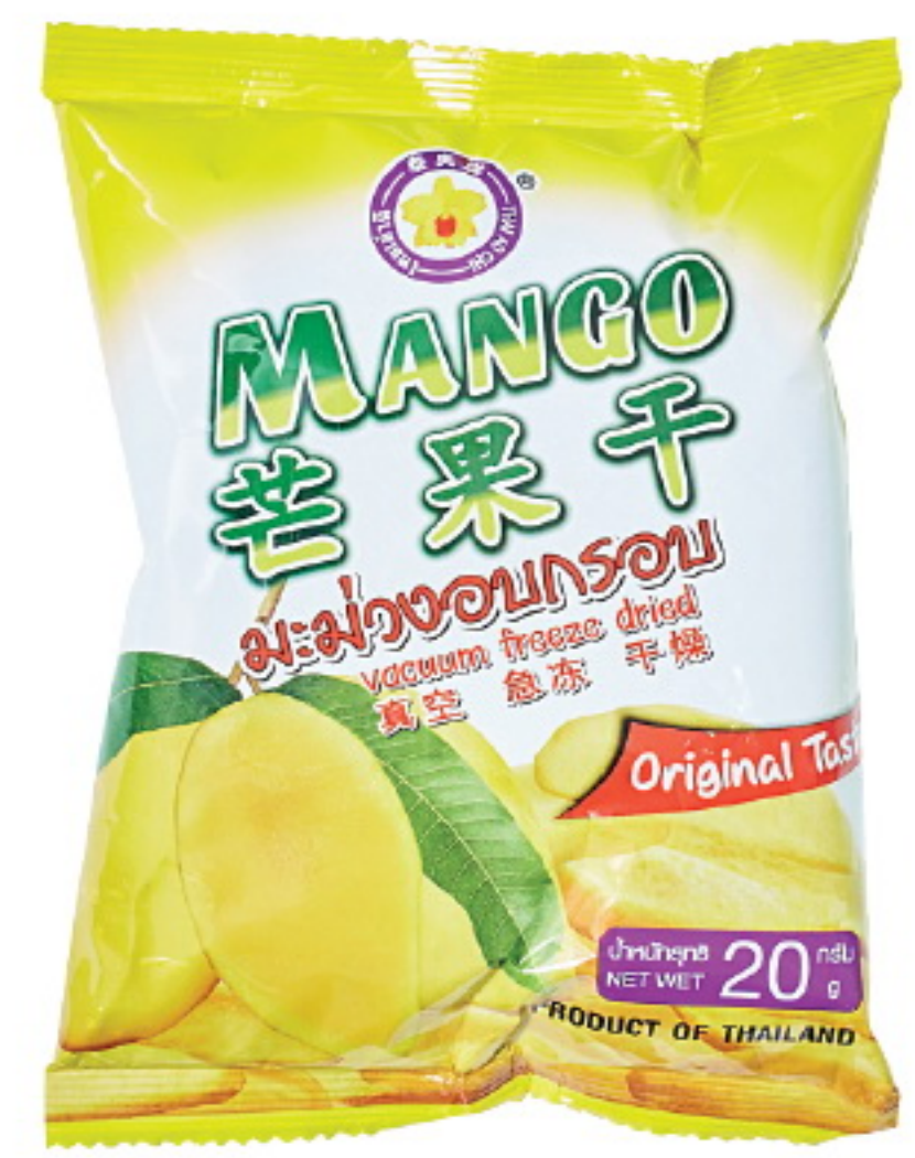
Mango 20 gm

SHELF LIFE : 18 MONTHS PACKING : 36 BAGS / CTN (20 GM x 36 BAGS) LOADING : 1,000 CTN / 20 FT