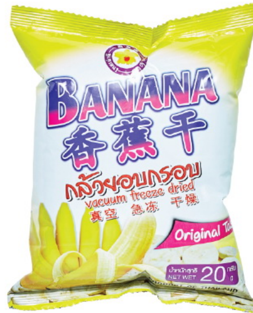
Banana 20 gm

SHELF LIFE : 18 MONTHS PACKING : 36 BAGS / CTN (20 GM x 36 BAGS) LOADING : 1,000 CTN / 20 FT