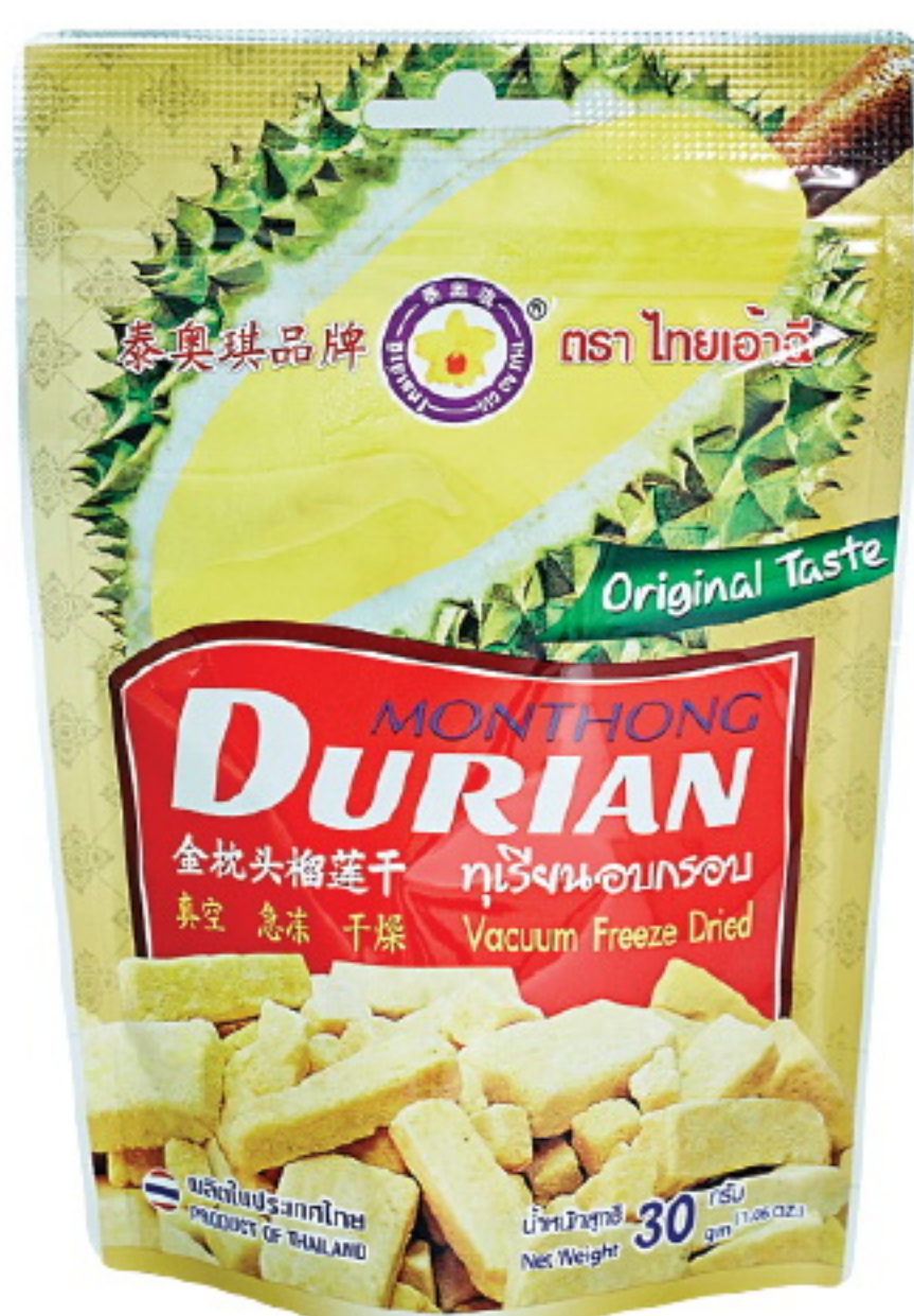
Durian 30 gm

SHELF LIFE : 18 MONTHS PACKING : 2.0 KG / CTN (100 GM x 20 BAGS) LOADING : 1,000 CTN / 20 FT