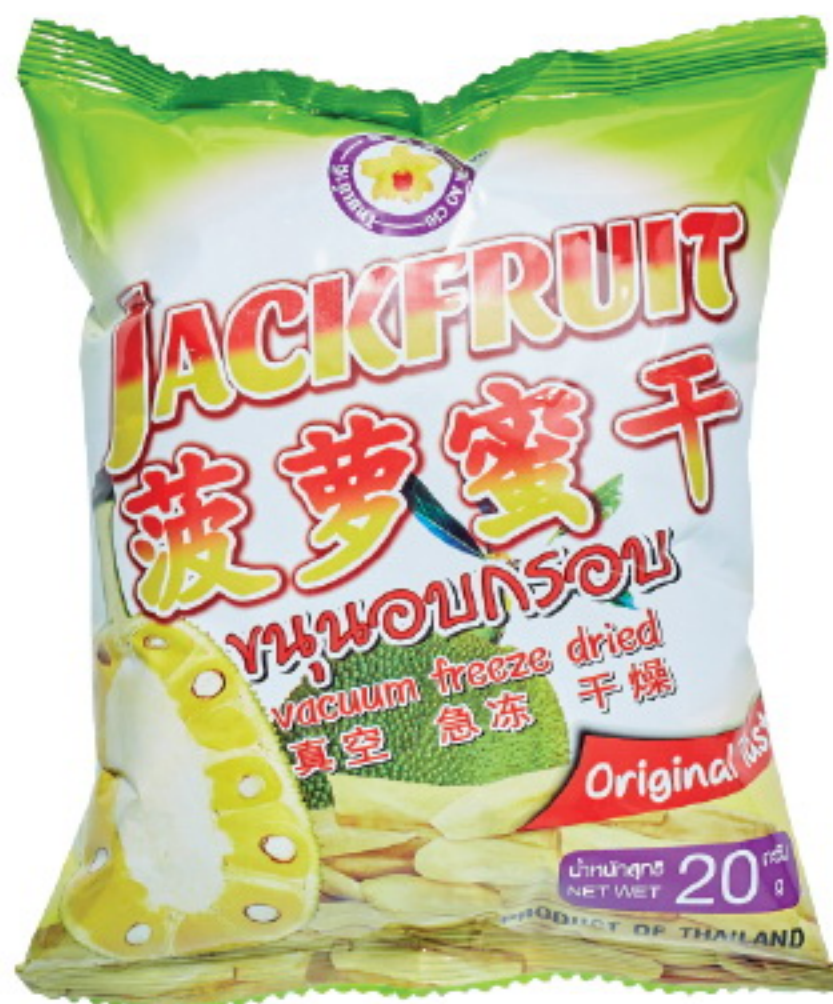
Jackfruit 20 gm

SHELF LIFE : 18 MONTHS PACKING : 36 BAGS / CTN (20 GM x 36 BAGS) LOADING : 1,000 CTN / 20 FT