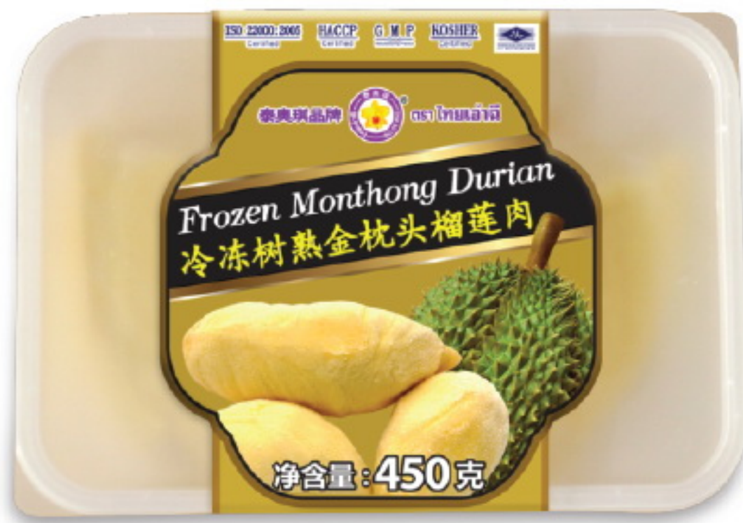
Durian 450 g