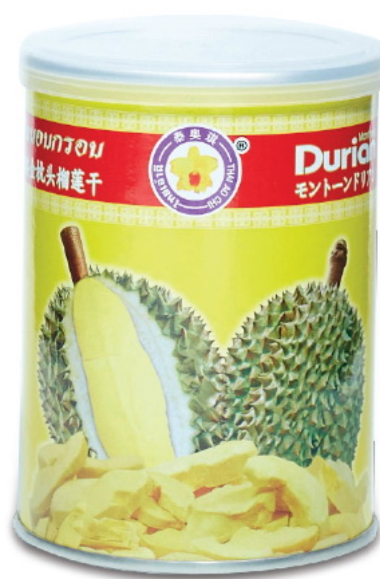
Durian 50 gm

SHELF LIFE : 18 MONTHS PACKING : 1.08 KG / CTN (30 GM x 36 BAGS) LOADING : 1,000 CTN / 20 FT