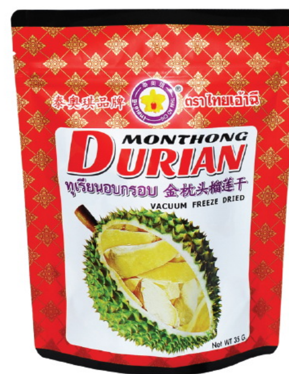
Durian 35 gm

SHELF LIFE : 18 MONTHS PACKING : 1.8 KG / CTN (50 GM x 36 CANS) LOADING : 1,000 CTN / 20 FT