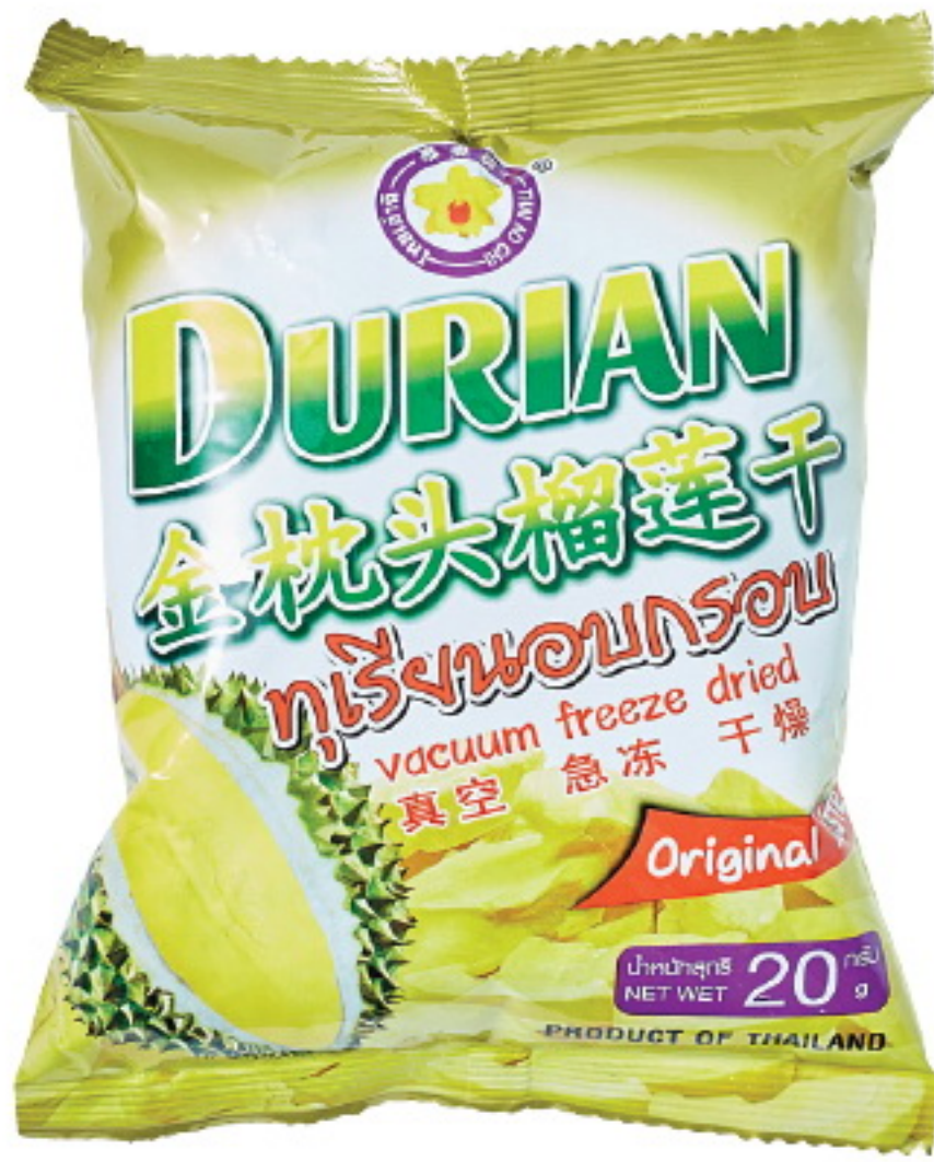
Durian 20 gm

SHELF LIFE : 18 MONTHS PACKING : 36 BAGS / CTN (20 GM x 36 BAGS) LOADING : 1,000 CTN / 20 FT