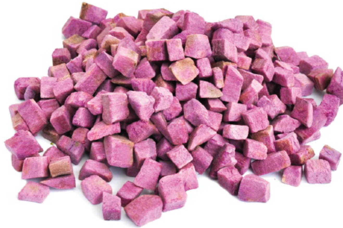
Sweet Purple Potato