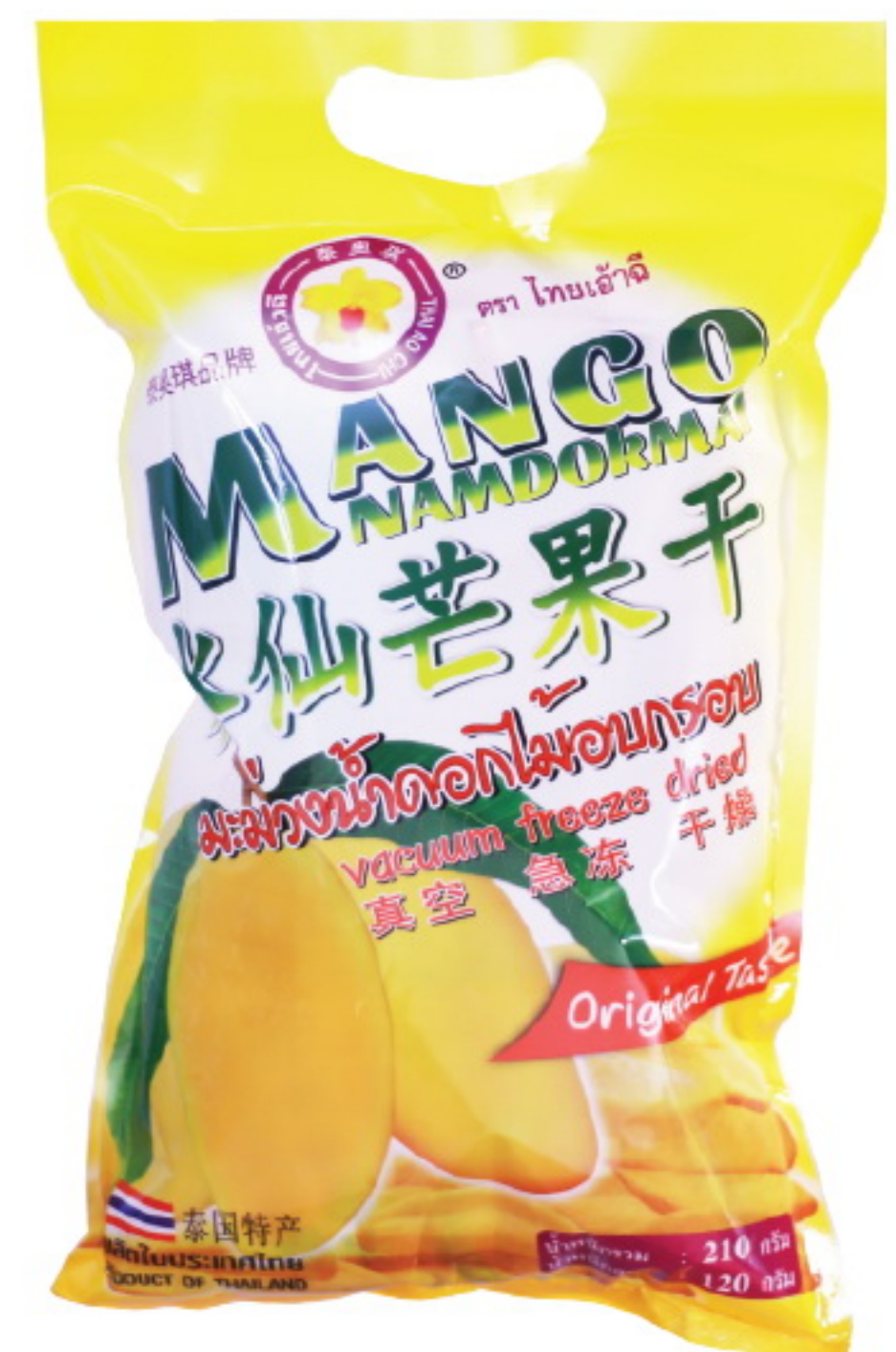
Mango 120 gm

SHELF LIFE : 18 MONTHS PACKING : 120 GM / CTN (20 GM x 6 BAGS) LOADING : 5,000 CTN / 20 FT