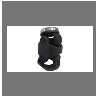
Double Cardan Assemblies