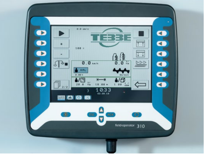
Ideally protected electronics and field-tested terminals

Subarea-specific spreading of organic fertilizers precisely matched to the nutrient needs of the ground: this is the key to tangible cost savings combined with a simultaneous yield improvement. This is why TEBBE has been equipping universal spreaders with precise weighing equipment and subarea-specific control equipment for years. Numerous large agricultural companies across the world now profit from technologies that TEBBE supplies in this field.