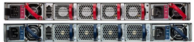
7020TR and 7020TRA Rear View: Front to Rear and Rear to Front