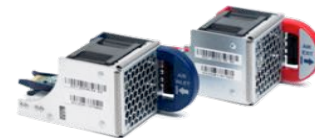
Hot swap fan modules