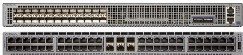
7020R: 24 port 10G and 48 port 100/1000 Mb and 6 port 10GbE Switch

Combined with Arista EOS, the 7020R Series delivers advanced features for big data, cloud, virtualized and traditional designs together with enhancements for video streaming, media and entertainment.