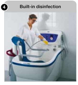
Built-in disinfection shower handle and automatic disinfection of the hydromassage system.