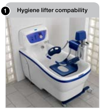
Century integrates with Alenti and Calypso.