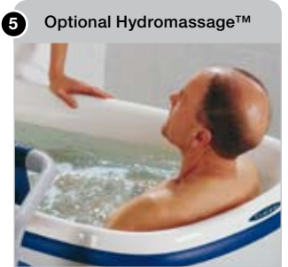
Hydromassage generates a gentle massaging effect that stimulates peripheral blood circulation and eases muscle tension.