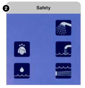
Two sensors scalding protection and Auto-fill, one level with possible afterfilling. The electronic control functions are operated by touch pad