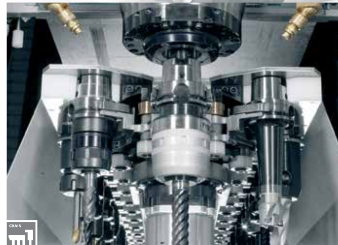
Automatic tool change with the pick-up method as fast as 1.5 s (40 tool places).