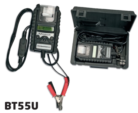
6/12V Voltmeter and Alternator Tester

Digital Tester for 12V batteries & starting/charging systems