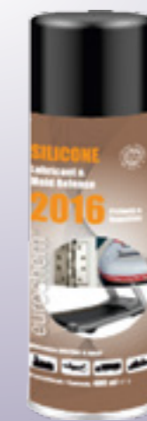
2016 - SILICONE LUBRICANT & MOLD RELEASE

Silicone lubricant for plastic and metallic equipment. Ideal for use as a release agent with all molds of aluminum or steel in extrusion plastic machines. Ideal for treadmills.