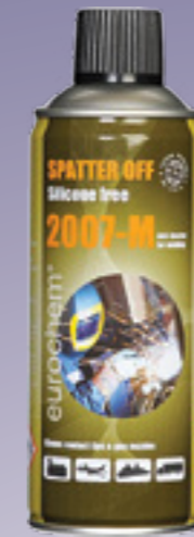
2007 - M SPATTER OFF

Silicone free product used on welding machines. Cleans contact tips and gas nozzles. Protects the nozzle tip and the surface from spatters.