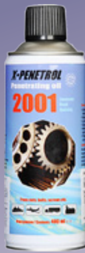
X - PENETROL

Anticorrosion - lubricant- dehydrating. It releases quickly and easily bolts, glued screws, nuts, mechanisms.