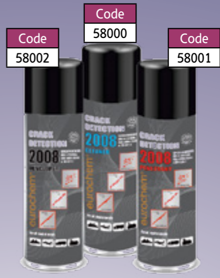
2008 CRACK DETECTION KIT

Rust guard. Long lasting protective coating for spare parts, outboard engines, cables, metallic surfaces etc. (hard film) This type of hard film gives better results against corrosion in relation with other products which form a soft film.