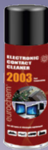
2003 CONTACT CLEANER

Very fast evaporating contact cleaner for all types of electrical and electronic equipment. Suitable for electronic components, circuits, switches, potentiometers, TV's, VCR's, etc.