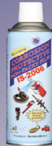
2006 - IS

Rust guard. Long lasting protective coating for spare parts, outboard engines, cables, metallic surfaces etc. (hard film) This type of hard film gives better results against corrosion in relation with other products which form a soft film.