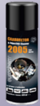
2005 CARBURETOR & INJECTOR CLEANER

Specially formulated to clean carburetors (interior - exterior), injection systems and input valves.