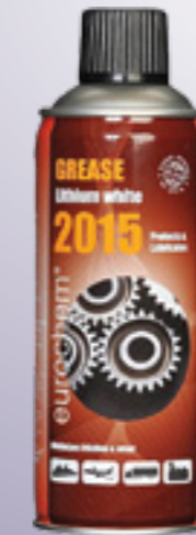
2015 LITHIUM GREASE

Excellent lubricant for long lasting lubrication. Drastically reduces friction and wear of metal and withstands at temperatures up to 150°C protecting from corrosion.