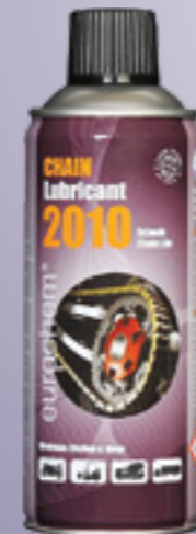
2010 - CHAIN LUBRICANT

Lubricates, reducing wear caused by strand abrasion and gear tooth contact. Suitable for conveyor systems, motorcycles, agricultural machines, construction engines, and marine systems.