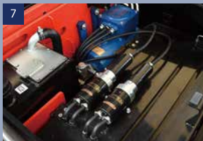
Explosion proof type battery