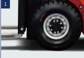
Explosion proof type tyres

We are the first forklift manufacturer to use National Explosion proof standard for gas and dust. Our Explosion proof degree has reached the Exdem(ib)mbs II BT4 Gb/Ex tD(ibD)mbD A21 IP65 T130°C and can be used in the gas environment of Zone1 & Zone2 and dust environment of Zone 21 & Zone 22 separately or coexist.