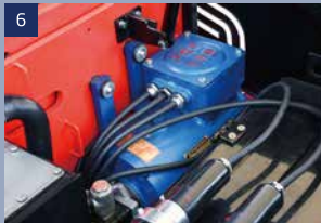
Explosion proof type AC motor