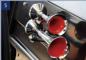
Explosion proof type air horn