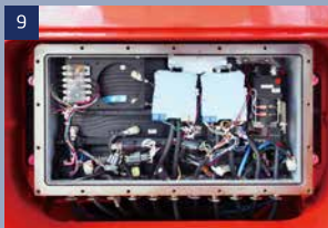
Electrical control system