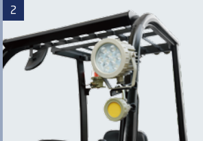
Explosion proof type LED lamp