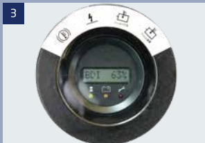
Explosion proof type instrument