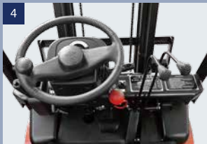
Comfortable operation space