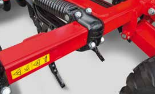
TerraGrip Release force 770 kg