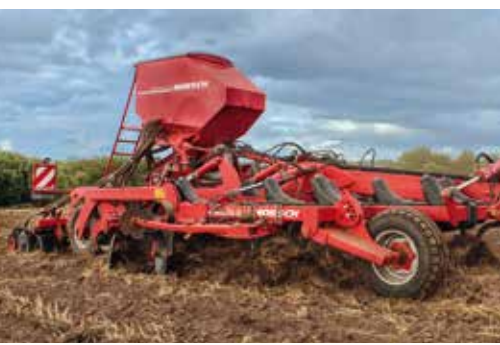
Pronto TD Universal Drill with TurboDisc coulters