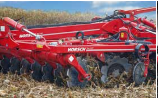
Heavy DiscSystem Arranged in two rows, disc diameter 68 cm, disc distance 40 cm, serrated discs with individual suspension