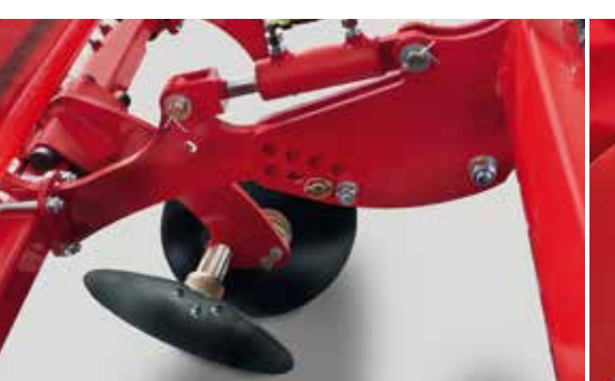
Rubber suspension Each pair of discs has a rubber suspension. Effective and maintenance-free trip release system.