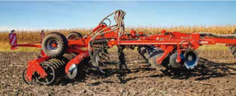
Double-RollPack at Tiger 4 MT rigid