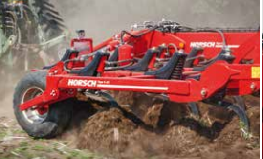
Hydraulic cylinder of the TerraGrip tine for release forces of up 770 kg (optional for first and second tine row for Tiger 5, 6, 8 AS)