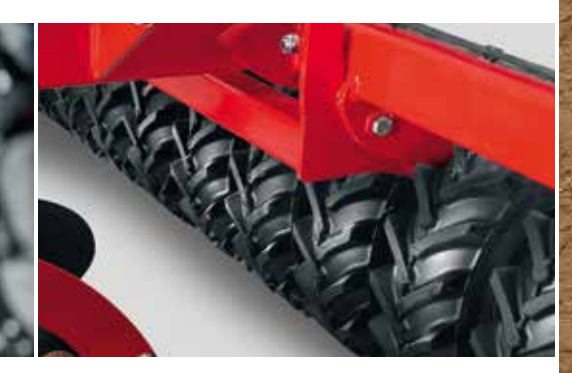
Robust tyre packing system Tyre packing system with optimised tyre thread. Suspended middle packer section serves as transport wheels for road transport.