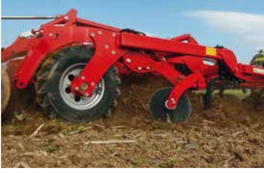
Tyre packing system Effective and deep consolidation while protecting the soil