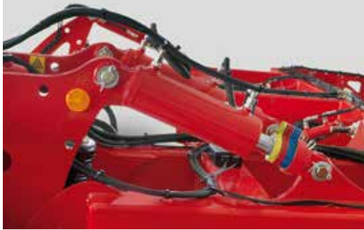
Variable depth setting With AluClip spacers easy working depth setting possible