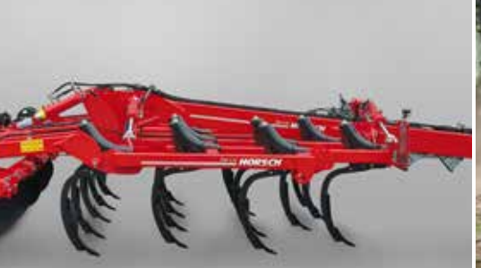
28 cm trip height, 500 kg trip force, maintenance-free