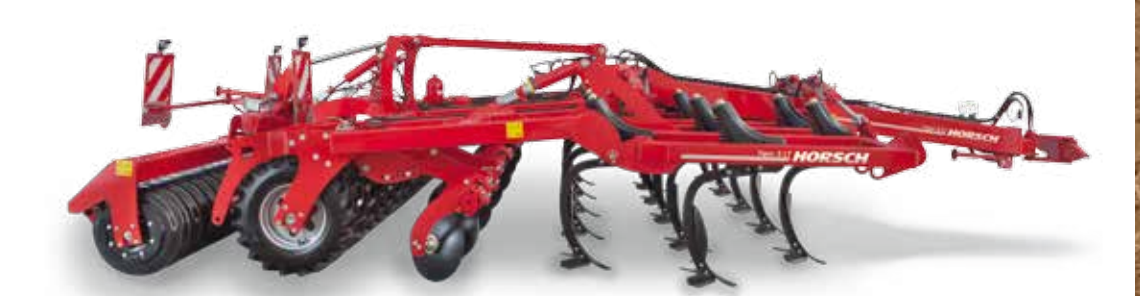
Tiger LT Three-bar frame design, 30 cm tine spacing, 85 cm frame height, single row of levelling discs, tyre and TopRing packing system