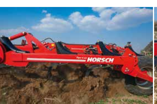
TerraGrip Intensive mixing and loosening with four rows of tines