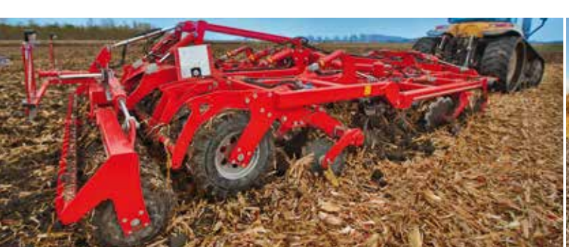
Tyre packer with optional SteelDisc packer