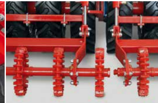
TopRing packing system Cast iron packer rings, mounted between tyres of packing system, effective seed-bed preparation and good consolidation