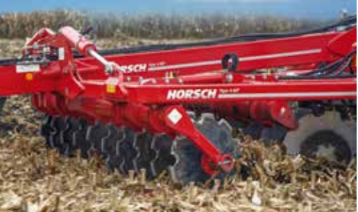
Two-row DiscSystem Cuts through all kinds of residues