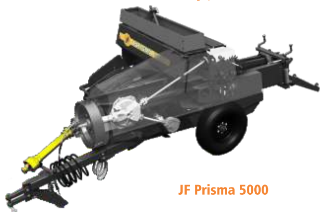
JF Prisma 5000