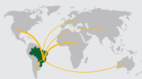
FROM BRAZIL TO ALL CONTINENTS OVER 50 COUNTRIES