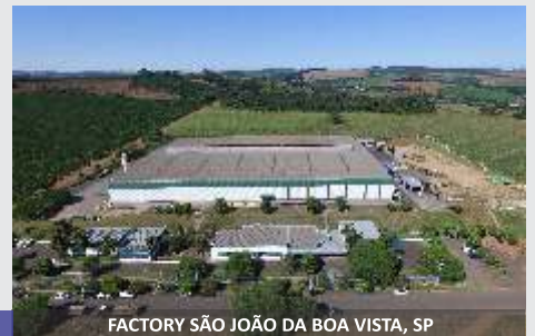
FACTORY SÃO JOÃO DA BOA VISTA, SP

Forage wagons line JF, the solution for the farmer!