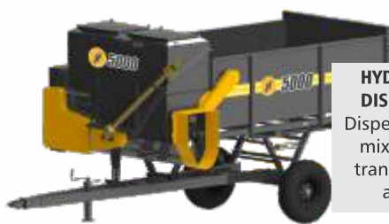
JF 5000 with HydraFeed (optional)

HYDRAFEED DISPENSER Dispenser with mixing and transporting auger