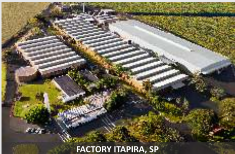
FACTORY ITAPIRA, SP