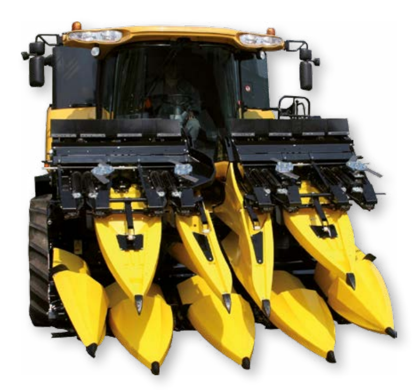
It is proven by field measurements that the

Usage of wider, multi-road adapters on high performance new combines is more cost-effective during harvesting