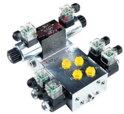
2 block LS