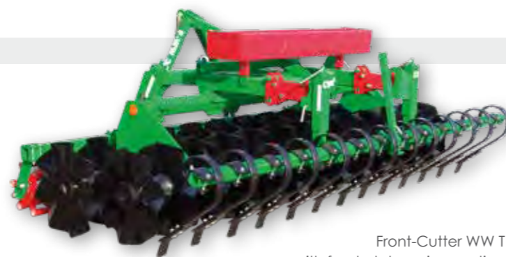
Front-Cutter WW T with front plate spring section