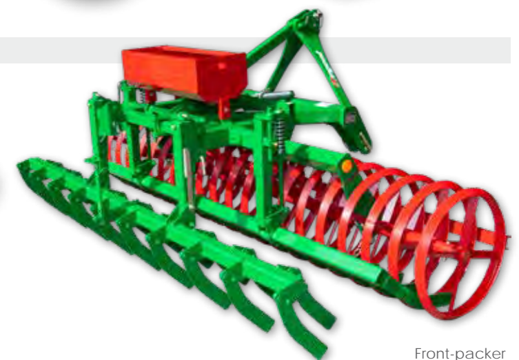
Front-packer with knife tine section