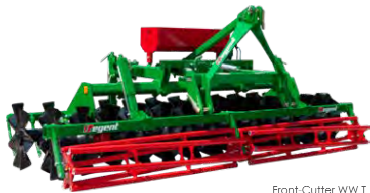
Front-Cutter WW T with tube roller and front knife tine