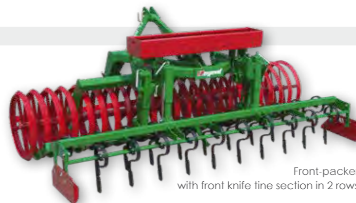
Front-packer with front knife tine section in 2 rows