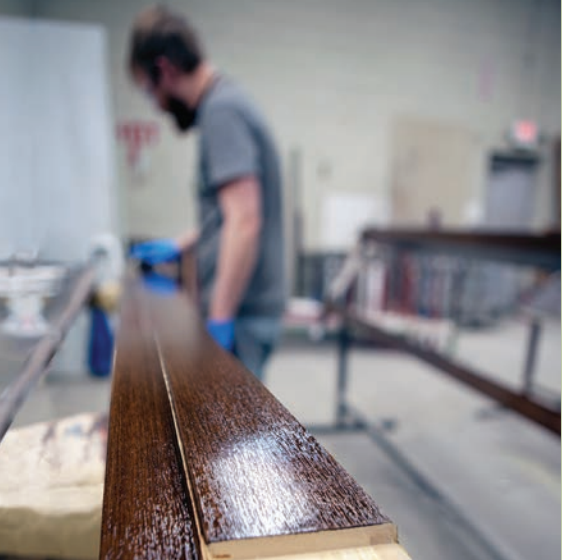
RENOLIT MLA can be stained to match exterior wood components.