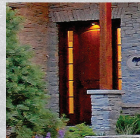
RENOLIT MLA is an ideal laminate for wood-based components. It is a white rigid PVC laminate that requires no finishing at installation but can take finishes beautifully.