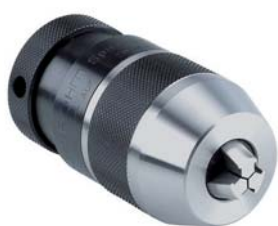
Quick-action drill chucks industry

Perfectly adapted in an intelligent design. Persevering and precise specialists for even the toughest jobs.