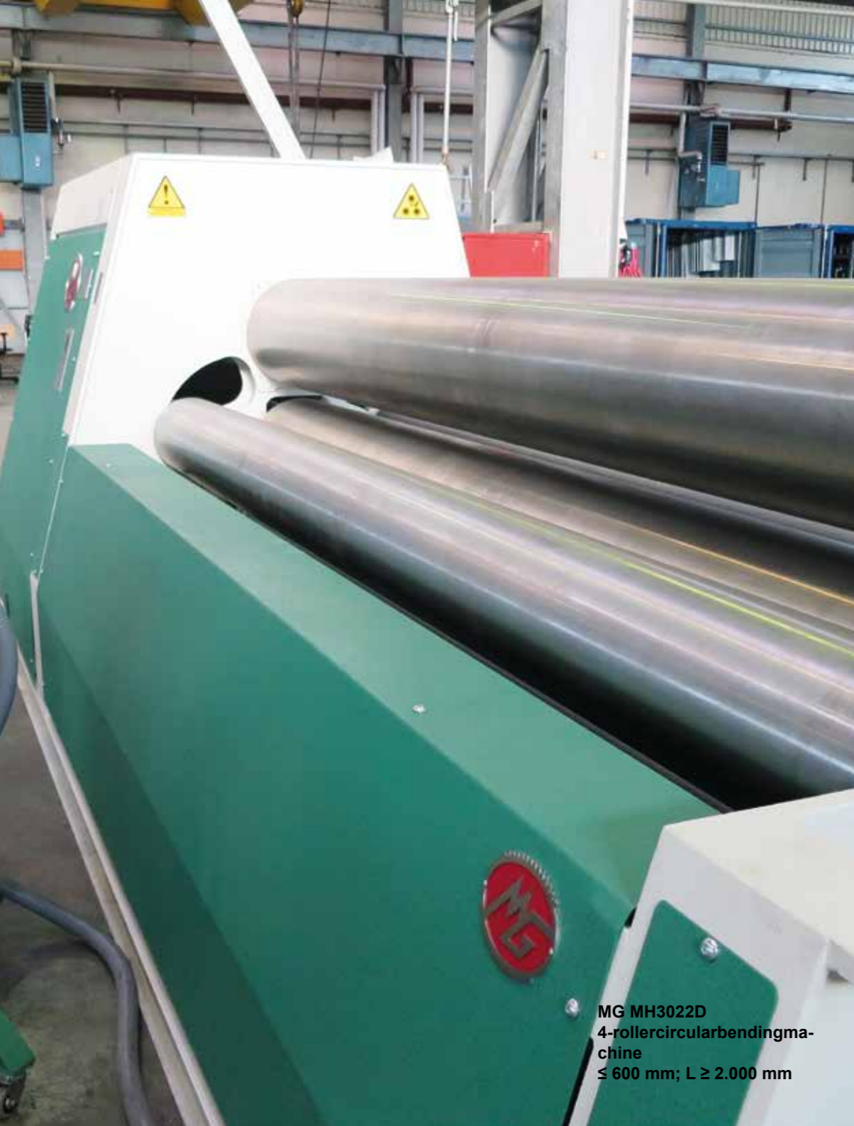
MG MH3022D 4-roller circular bending machine ≤ 600 mm; L ≥ 2.000 mm