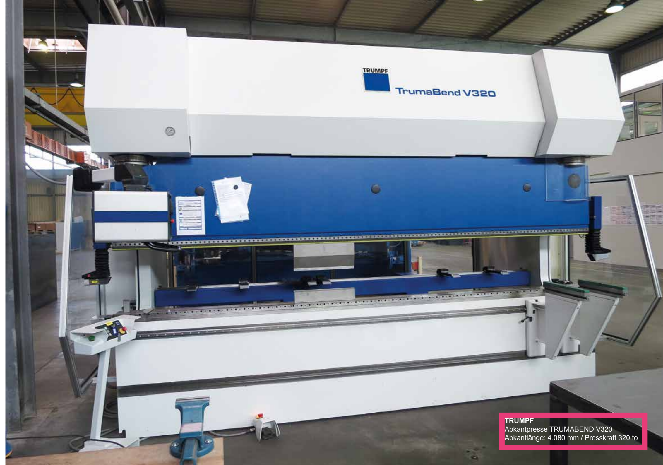
TRUMPF Abkantpresse TRUMABEND V320 Abkantlänge: 4.080 mm / Presskraft 320 to