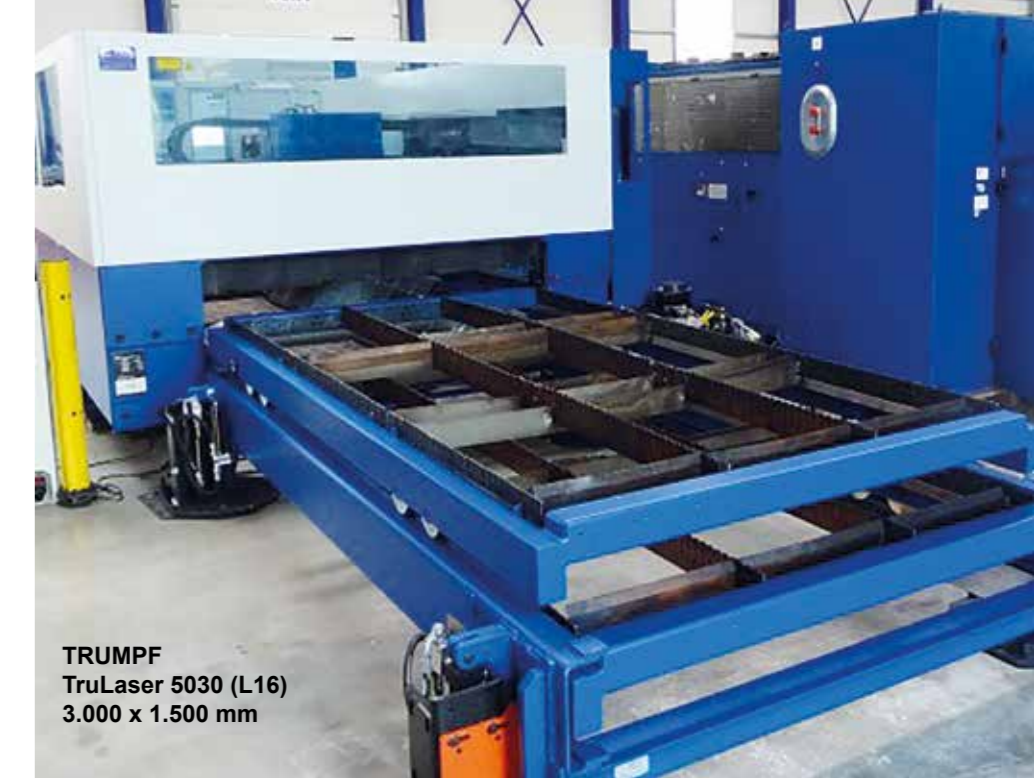
TRUMPF TruLaser 5030 (L16) 3.000 x 1.500 mm

Vessels / heat exchangers / special constructions (double shell) pipe lines / technical appliances / auxiliary construction for plant revision / welding