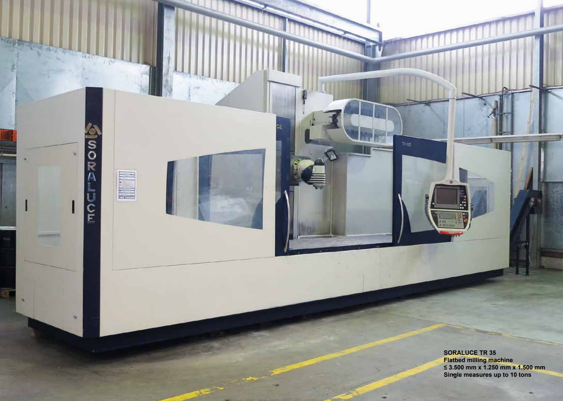
SORALUCE TR 35 Flatbed milling machine ≤ 3.500 mm x 1.250 mm x 1.500 mm Single measures up to 10 tons