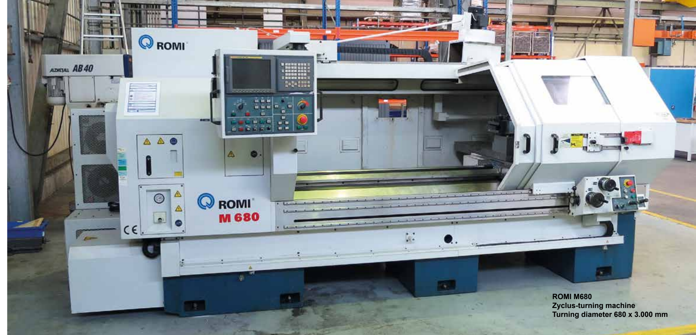
ROMI M680 Zyclus-turning machine Turning diameter 680 x 3.000 mm