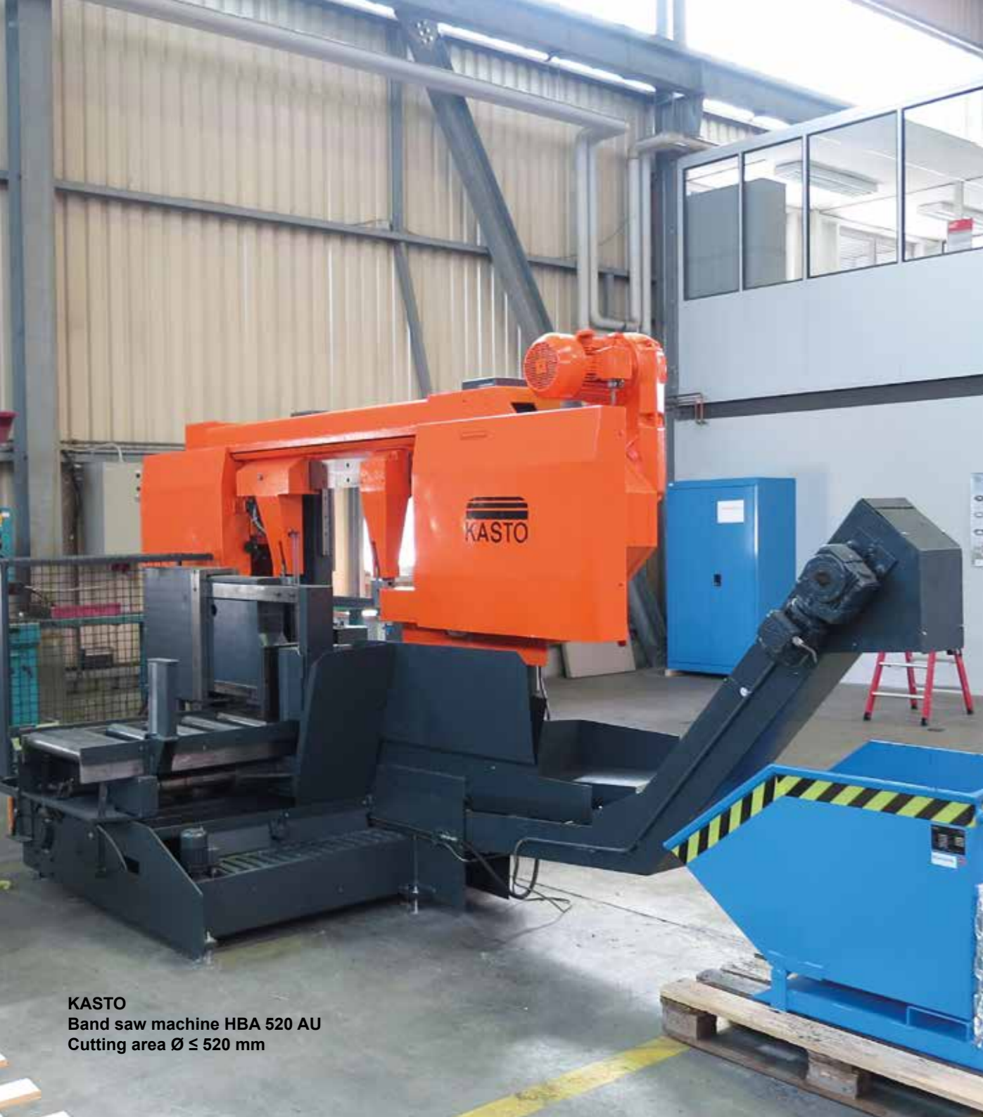
KASTO Band saw machine HBA 520 AU Cutting area \varnothing \leq 520 mm