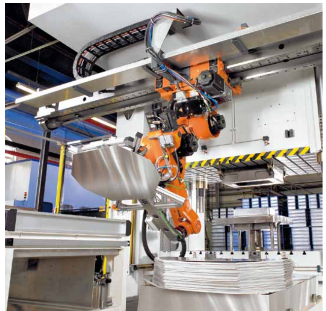
Single press system with robot automation.

Efficient and reliable. Hydraulic single press systems can be loaded or unloaded manually or automatically. In combination with coil lines, destackers / blankloaders or tri-axis transfer systems, they can be used to create turn-key system solutions for cost-effective part production. Equipped with hydraulic bed cushions, cutting shock dampening, slide parallelism control and dynamic cylinder mode switching, hydraulic presses meet all the requirements for efficient production in the stamping plant. A data analysis system supports the press operator with straightforward fault diagnostics of the entire system and helps raise productivity.