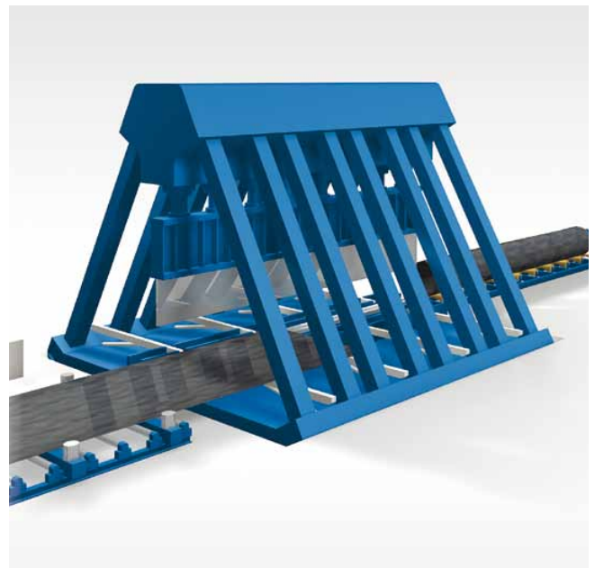
The new Schuler LFJ- hydraulic pipe forming press .

Large pipes. As a leader in forming technology, Schuler uses innovative hydraulic press technology for manufacturing large pipes. Whether as an individual press or fully integrated into a complete pipe plant: hydraulic presses from Schuler provide a decisive competitive edge when it comes to manufacturing longitudinally welded large pipes. Schuler uses two technologies for manufacture: