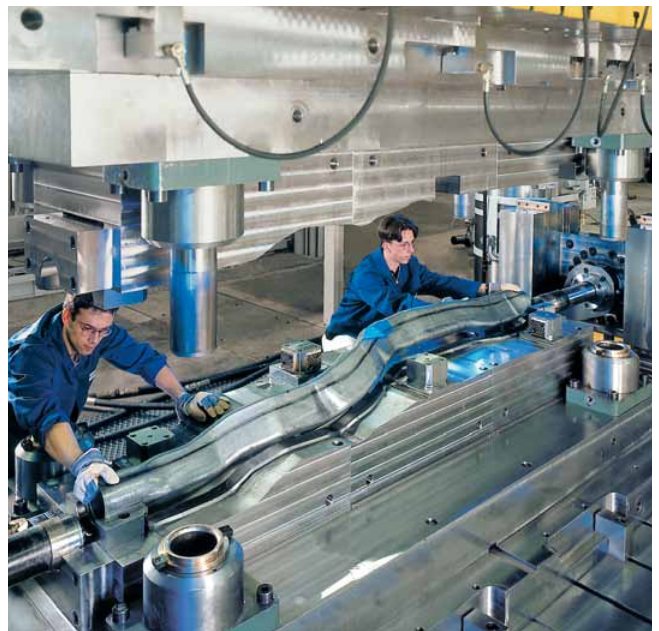
Side members manufactured by tubular hydroforming.

There is a large variety of possibilities for hydroforming. It is used in automotive design where light weights, design freedom and structural strength are needed. It also provides opportunities to reduce multiple joined parts into one formed component. The process is used to form exhaust, chassis and structural components. Schuler provides design support, component analyses, feasibility studies, prototyping, dies and full scale part production – all from a single source. The process of hydroforming under supporting pressure also allows the use of higher-strength steels.