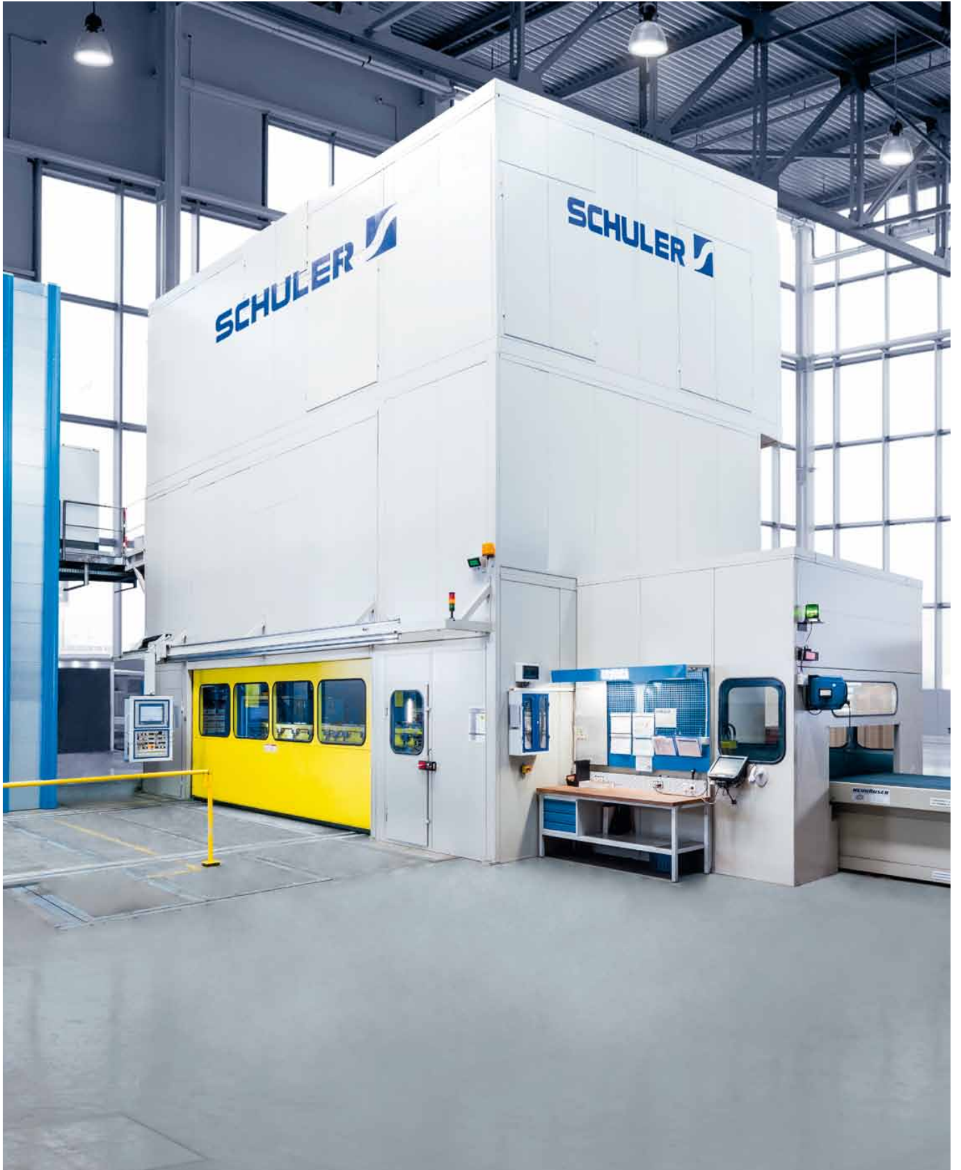
Hydraulic transfer press to manufacture truck components.