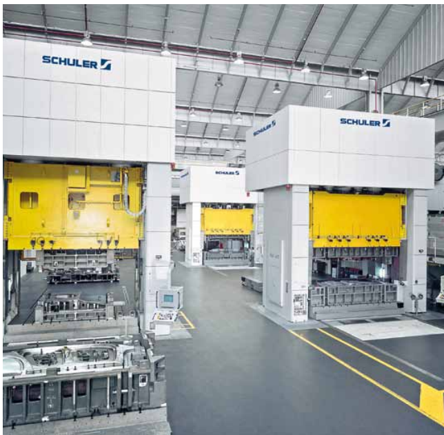
Tryout center with hydraulic tryout presses.