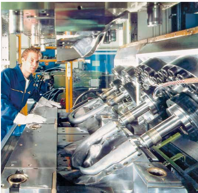
High volume production of structural parts using the hydroforming process.