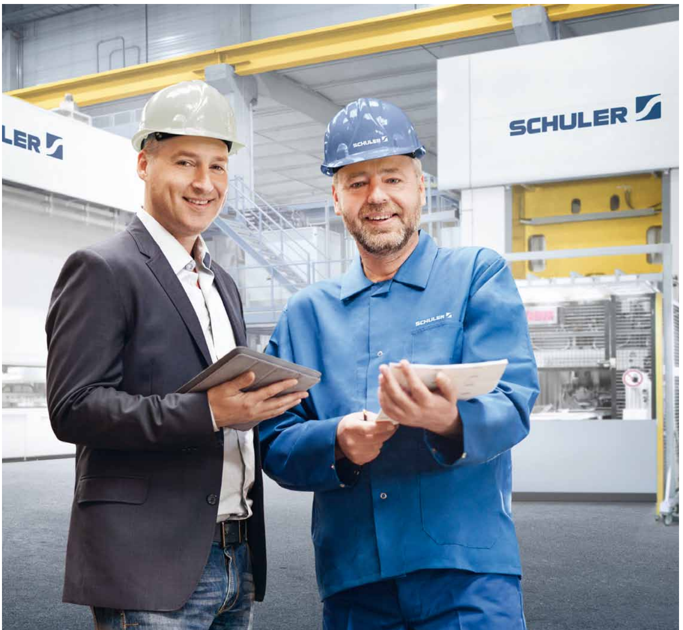
Schuler Service – Customer-oriented, efficient, worldwide.

Schuler Service offers a tailored portfolio of services covering the entire life cycle of your equipment.