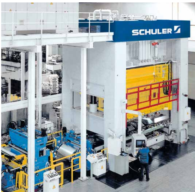
Hydraulic transfer press with 12.000 kN capacity.