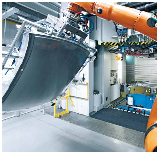
Manufacturing cell for fibre-reinforced components automated by robots.

Minimal part weight. Fiber-reinforced plastics offer a great deal of scope for design, as well as minimum component weight. These advantages are also proven in autobody production. Schuler hydraulic press systems deliver innovative solutions for high volume production of fiber-reinforced plastics, and meet the most demanding requirements for component production. Hydraulic press systems are suitable for series production of SMC (sheet molding compound) components, GMT (glass mat thermoplastics) components, and RMT (resin transfer molding) components. The result: Best parts quality and maximum production reliability – for greater economic efficiency and maximum productivity.