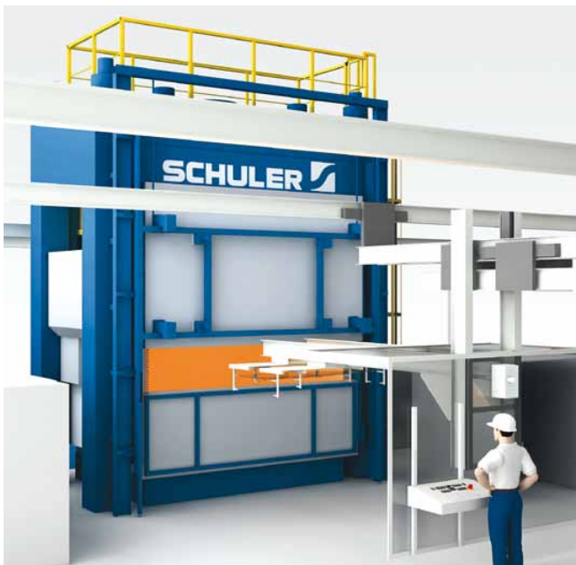
Hot forming cell with hot press, pre-heating furnace for dies and parts manipulator.

New generation of hot forming presses. Schuler and FormTech GmbH have created a partnership called “Titanium Forming Alliance” in order to offer a new generation of hot presses to the aviation and aerospace industry. FormTech has outstanding know-how in this field – from the development of forming technologies, dies and part design through prototype manufacturing and small series production as well as mass production.