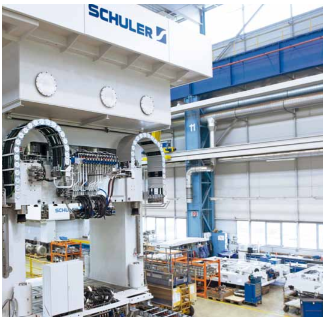
Hydraulic press for manufacturing fiber-reinforced plastics at Schuler SMG in Waghäusel, Germany.

Minimal part weight. Fiber-reinforced plastics offer a great deal of scope for design, as well as minimum component weight. These advantages are also proven in autobody production. Schuler hydraulic press systems deliver innovative solutions for high volume production of fiber-reinforced plastics, and meet the most demanding requirements for component production. Hydraulic press systems are suitable for series production of SMC (sheet molding compound) components, GMT (glass mat thermoplastics) components, and RMT (resin transfer molding) components. The result: Best parts quality and maximum production reliability – for greater economic efficiency and maximum productivity.