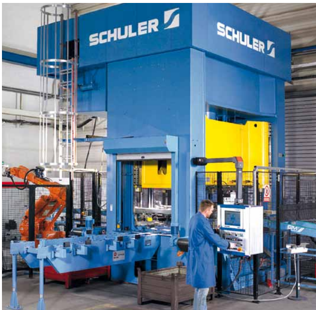
Automated hydraulic system solutions.