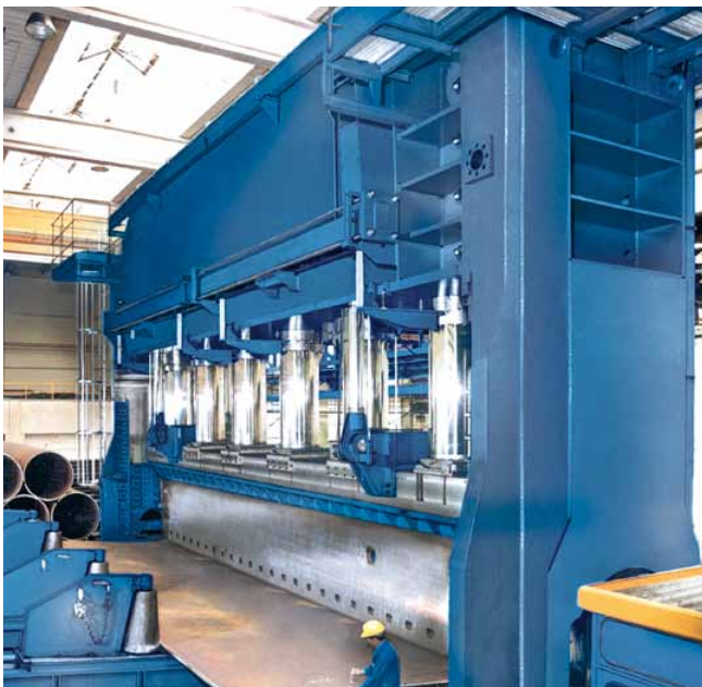
J-press for the step forming process in conventional design.

Large pipes. As a leader in forming technology, Schuler uses innovative hydraulic press technology for manufacturing large pipes. Whether as an individual press or fully integrated into a complete pipe plant: hydraulic presses from Schuler provide a decisive competitive edge when it comes to manufacturing longitudinally welded large pipes. Schuler uses two technologies for manufacture: