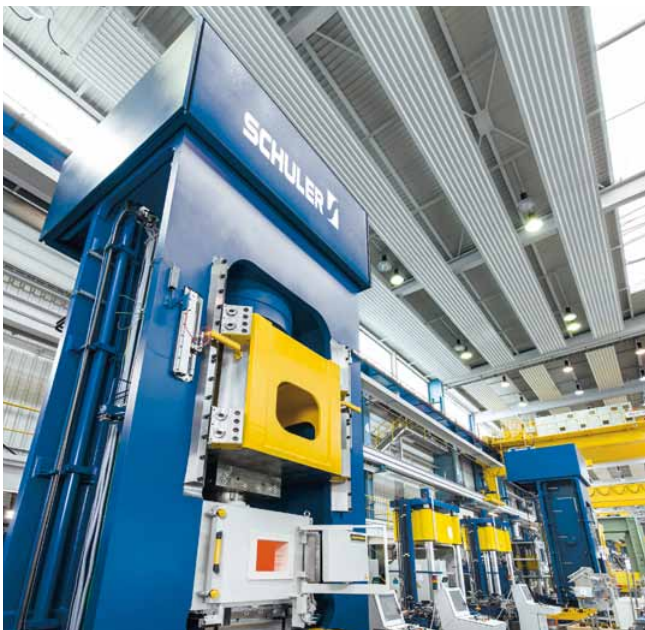
Isothermal forming press.

Efficient forming of titanium. In cooperation with FormTec, Schuler developed a new generation of presses. Innovative heating and insulation elements guarantee even heat distribution and high surface quality. Low external temperature reduces stress on machine elements and increases operator safety. High quality construction of all press components with a precise press force profile plus finely adjustable speed and precise guide systems increases component quality, guarantees high reproducibility and extends die service life.