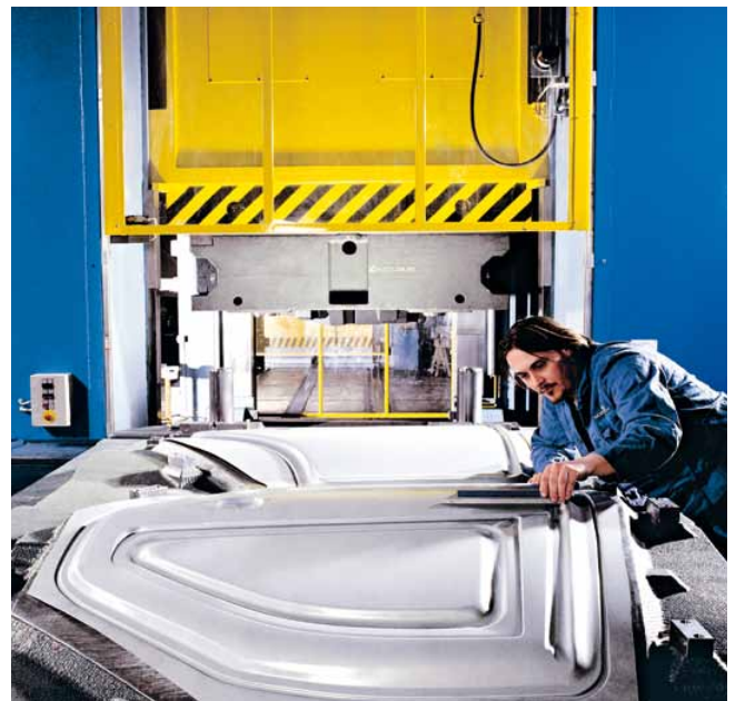
Focus on part quality.