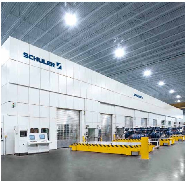
Hydraulic press line with blank loader automated by robots.