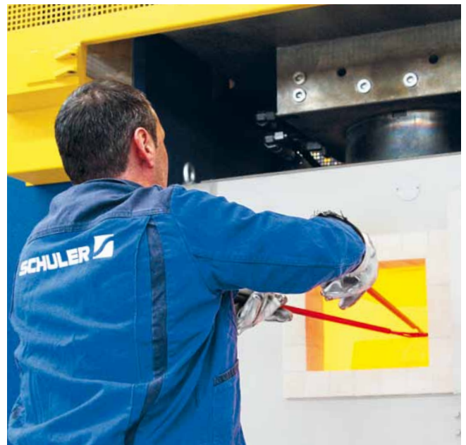
Heating chamber in a isothermal forming press.

Efficient forming of titanium. In cooperation with FormTec, Schuler developed a new generation of presses. Innovative heating and insulation elements guarantee even heat distribution and high surface quality. Low external temperature reduces stress on machine elements and increases operator safety. High quality construction of all press components with a precise press force profile plus finely adjustable speed and precise guide systems increases component quality, guarantees high reproducibility and extends die service life.