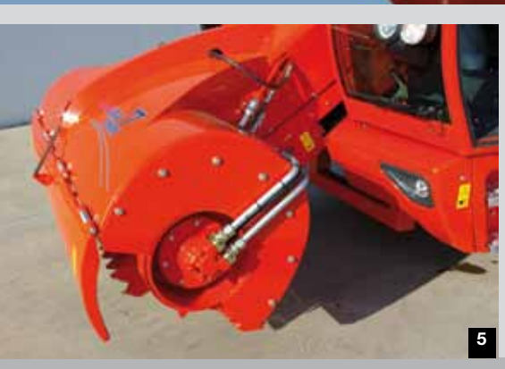
5. Tillaging roller diameter 400 mm, driven by 2 hydraulic motors, power 110 kW, rotation speed 0:670 rpm.