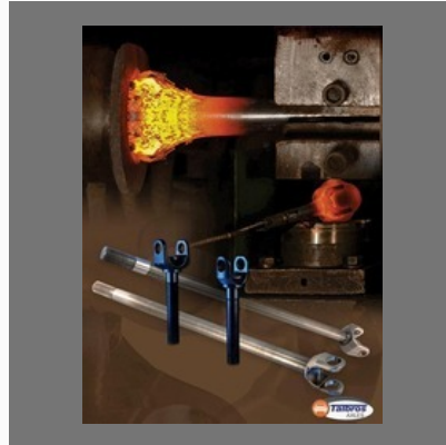
Front Axle Shafts