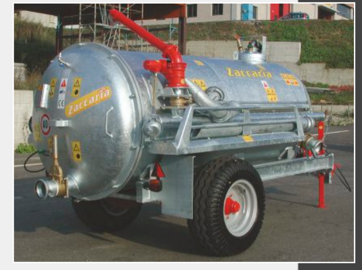
ZAM C 30 360° hydraulic swinging sprinkler

Increased depressor. 360° hydraulic swinging sprinkler. Hydraulic tilt sprinkler. Lateral suction with hydraulic or manual flood gate. Driving axle.