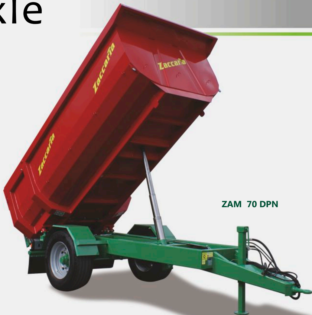
ZAM 70 DPN