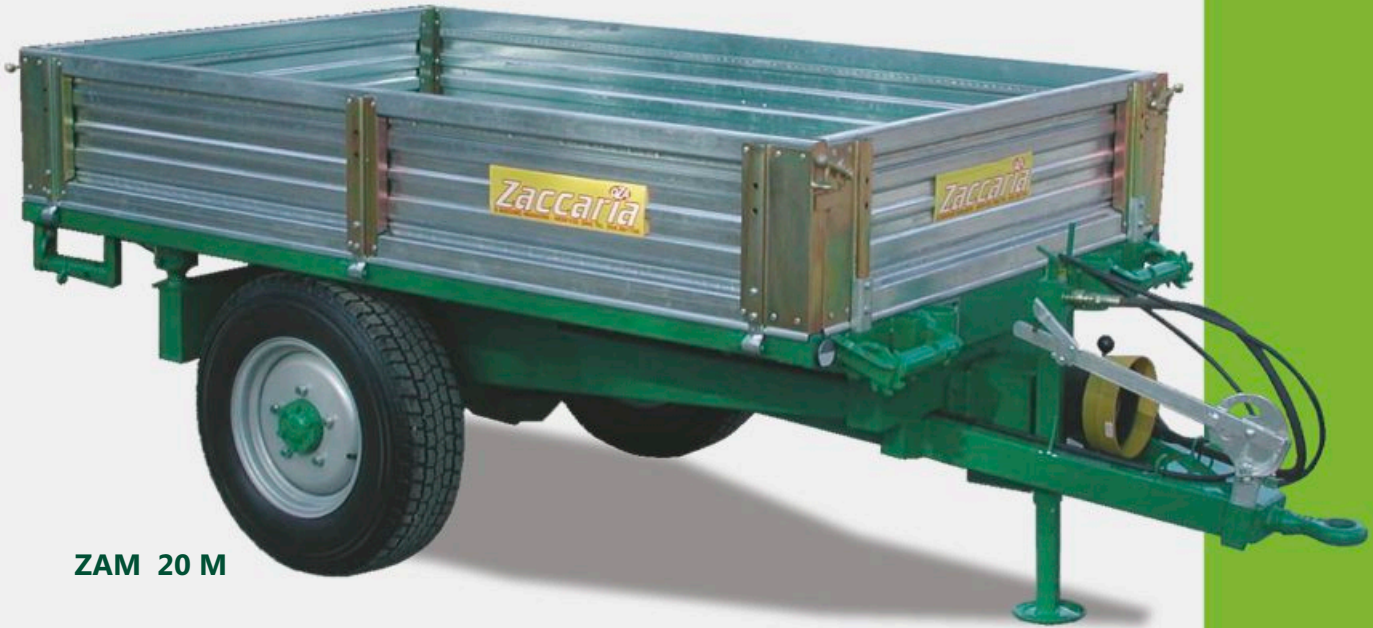
ZAM 20 M