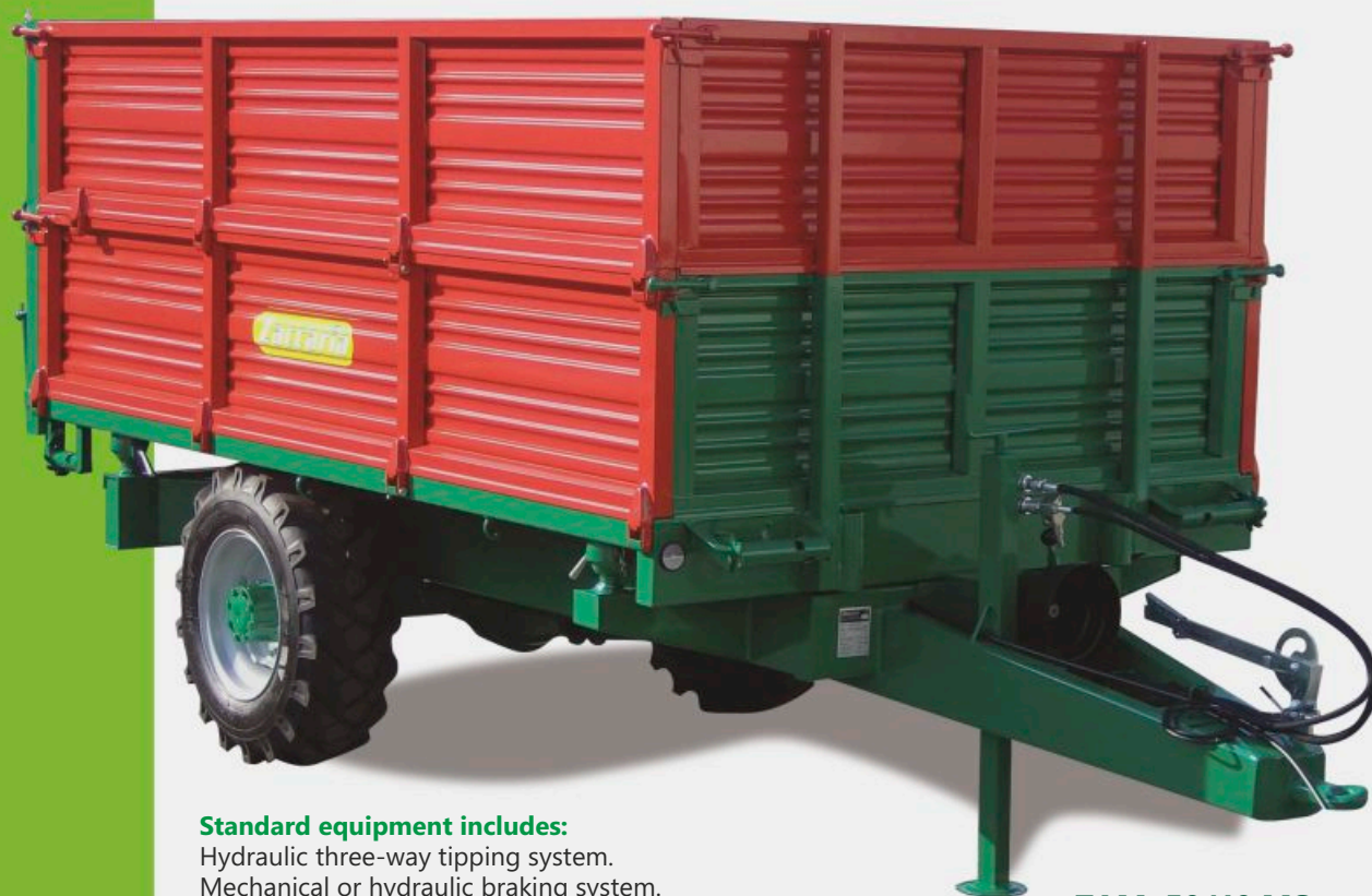
ZAM 50/40 MS with extensions sides