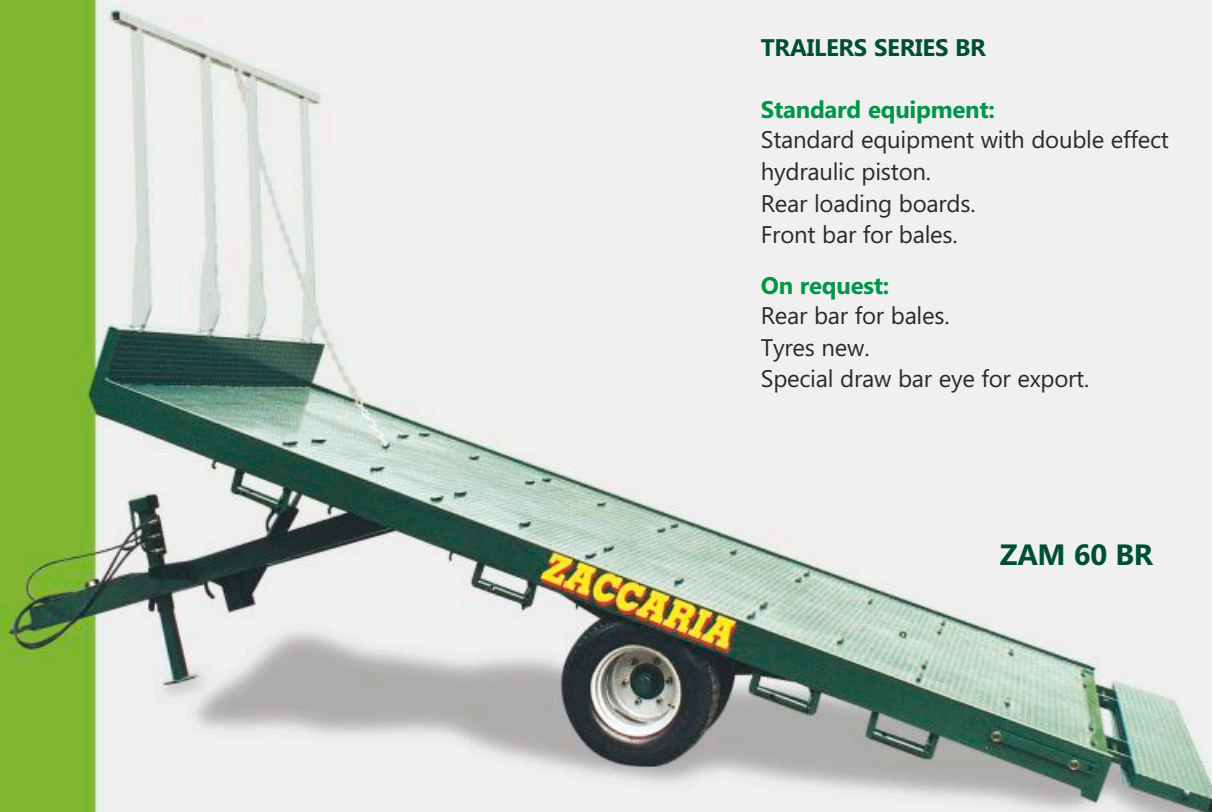
ZAM 60 BR