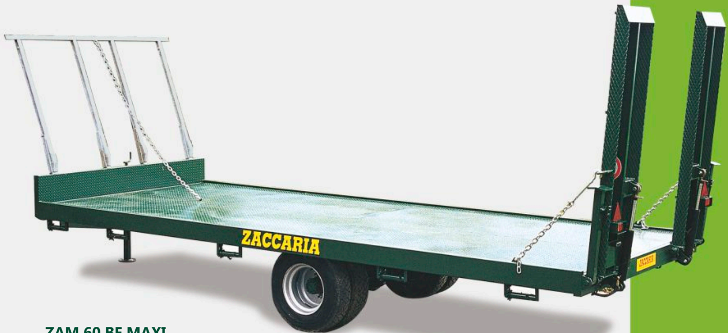
ZAM 60 BF MAXI