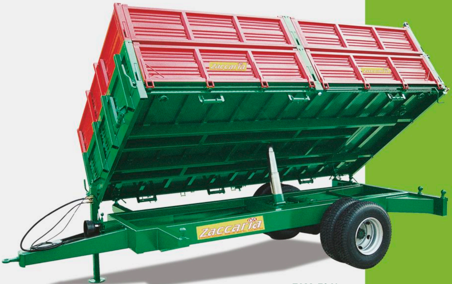
ZAM 70 N with extension sides and industrial columns