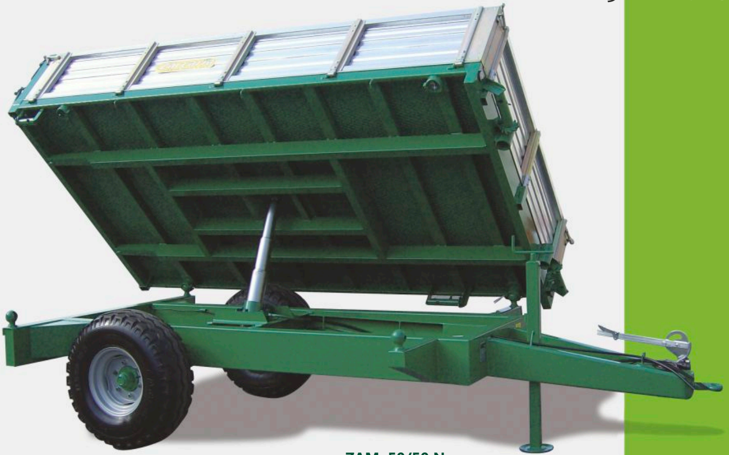
ZAM 50/50 N